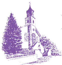
Sand Lane Mission 207 Sand Lane