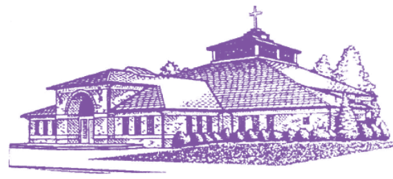
Main Church 120 Jerome Avenue

South Beach Staten Island, New York 10305