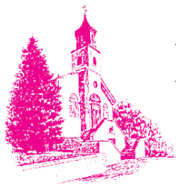
Sand Lane Mission 207 Sand Lane