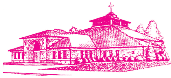
Main Church 120 Jerome Avenue

South Beach Staten Island, New York 10305